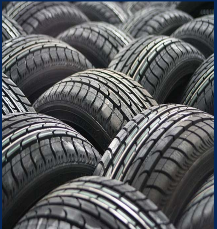
Tyre pressure is paramount for vehicle safety and efficiency

Due to the extreme environment inherent in this application: the extreme G-forces, high temperature, and shock and vibration conditions present at the wheel, specialist parts and testing above the normal AEC-Q200 level is normally required. Always contact your supplier's engineering team in this instance. If you have a query relating to a tyre pressure monitoring frequency control requirement our team will be happy to advise you, please contact us at sales@golledge.com .