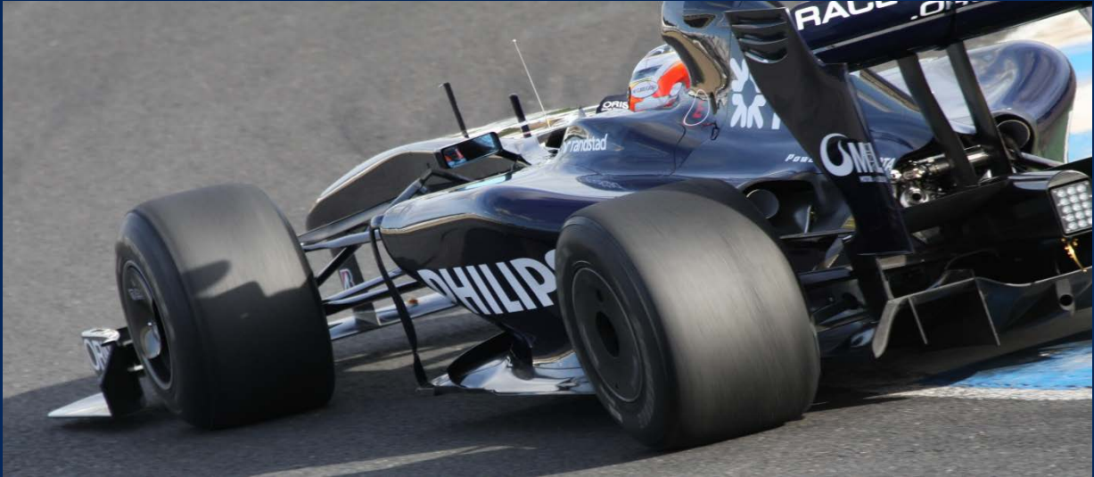
Formula 1 cars require sophisticated telematics systems