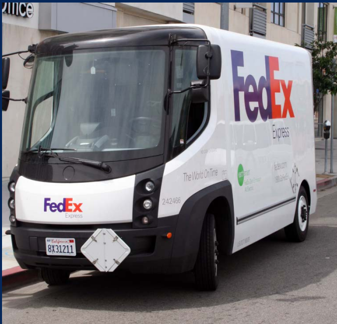
Fleet management systems increase business security