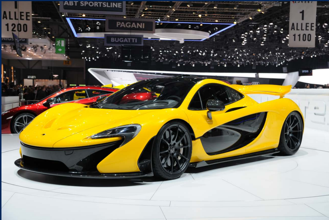
Plug-in electric hybrid car