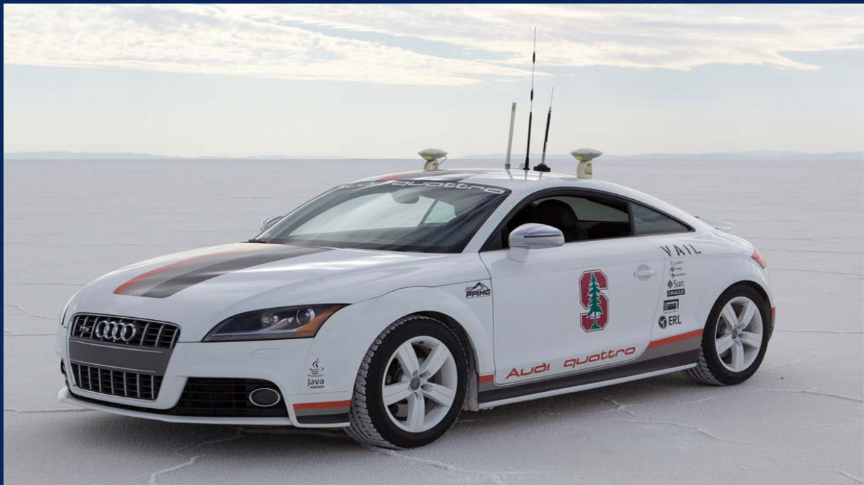
Fully connected cars are fast becoming a reality