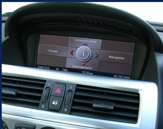
In-Car Bluetooth Communication System